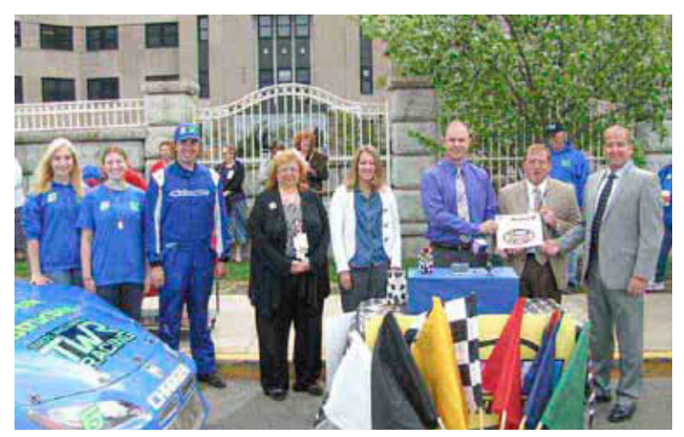
Holland Speedway generously donated 250 complimentary tickets to Buffalo VA Medical Center Veterans.