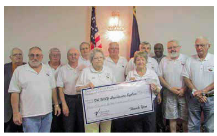
The Brockport Elks Lodge 2110 donates annually to the medical center. This year $1,000 was donated to Recreation Therapy Service and $250.00 to the Women's Center for Hope.