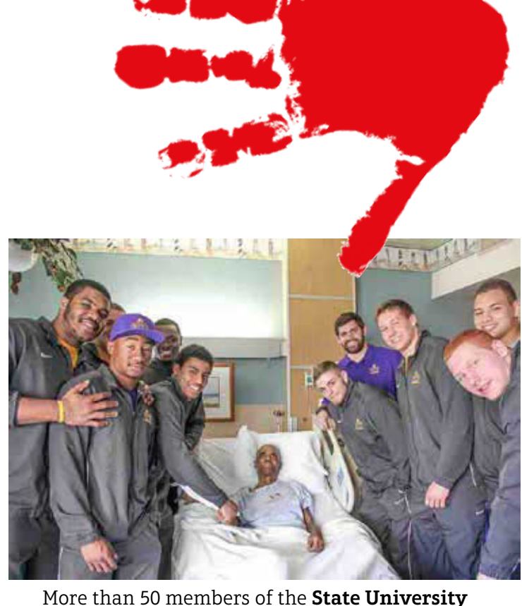
More than 50 members of the State University of New York at Albany Great Danes football team, escorted by VA volunteers, took time to visit with Veterans this summer. Additional photo below