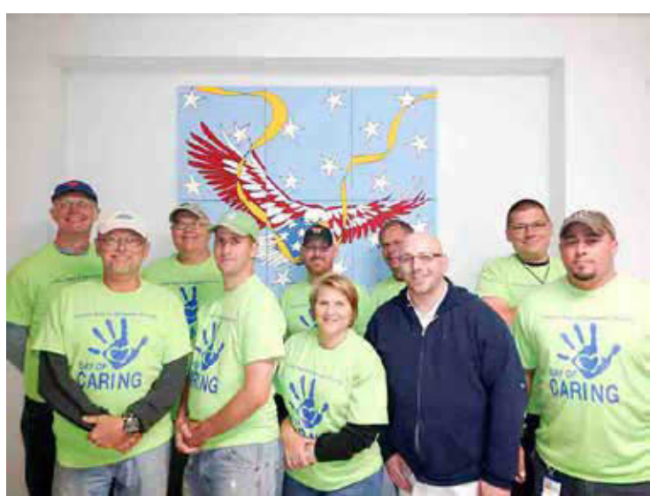
Genesee County United Way employees volunteer annually as part of a "Day of Caring." This year, during the month of May, United Way volunteers gave back to Veterans by helping beautify Batavia VA grounds.