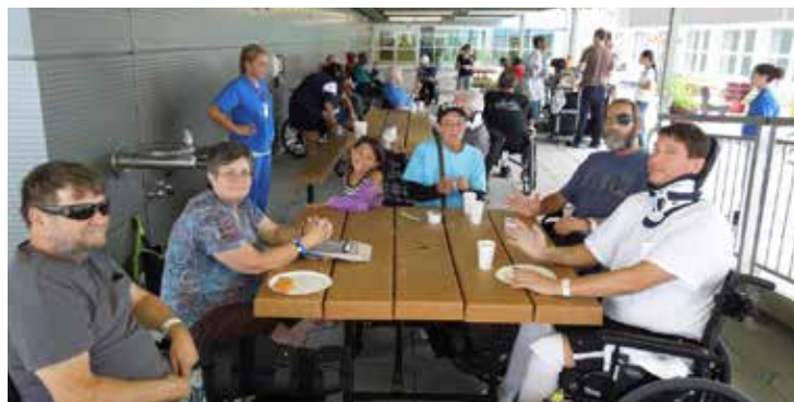
The horticulture garden is a very active social center.

A special thanks to the organizations that provided activity, in kind, and monetary donations for the medical center during the months of April, May and June!