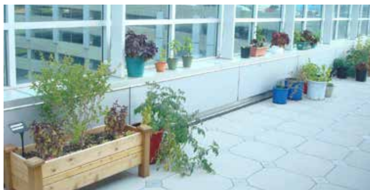
Horticulture Therapy plants.

Patients work indoors when the weather is bad and pot plants to put in their rooms.